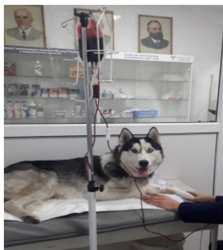
Figure 3. Transfusion of erythrocyte mass to a recipient dog with hemolytic anaemia caused by babesiosis

transfusion was performed in sick dogs, taking into account the results of clinical examination and changes in haematological parameters indicating the presence of anaemia (Fig. 3).