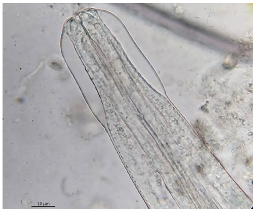
Figure 4. The anterior end of Syphacia obvelata at the L1 stage ( \times 600 )