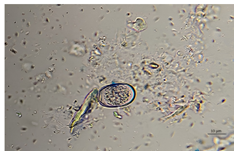
Figure 6. Egg of Aspicularis dinniki at the onset of incubation ( \times 400 )

Eggs of Aspicularis dinniki (Figs. 6-7) were similar in general shape to those of other members of the genus, with a smooth, transparent shell and a clearly visible embryo in the early stages of development. Cultivation did not yield positive results. During the first few days, germ cell division was observed, indicating initial egg activity and favourable conditions for development. However, by days 4-5, the developmental process abruptly stopped, and despite further observation, no viable larvae were obtained. This suggests species-specific sensitivity to cultivation parameters or limited adaptability to artificial incubation conditions.