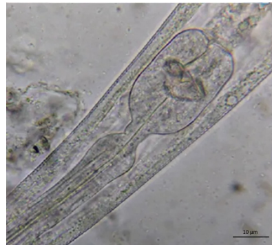
Figure 5. Morphology of the esophageal bulb in Syphacia obvelata L1 larvae. ( \times 600 )

Eggs of Aspicularis dinniki (Figs. 6-7) were similar in general shape to those of other members of the genus, with a smooth, transparent shell and a clearly visible embryo in the early stages of development. Cultivation did not yield positive results. During the first few days, germ cell division was observed, indicating initial egg activity and favourable conditions for development. However, by days 4-5, the developmental process abruptly stopped, and despite further observation, no viable larvae were obtained. This suggests species-specific sensitivity to cultivation parameters or limited adaptability to artificial incubation conditions.