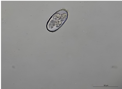
Figure 7. Egg of Aspicularis dinniki 24 hours after the start of incubation ( \times 400 )