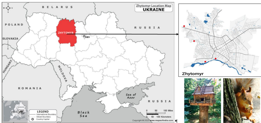
Figure 1. Cartographic representation of the experiment

mounted at a height of 1.5 m to provide coverage of the feeder and the surrounding area. The camera settings included 10 MP resolution and night mode with infrared illumination. It automatically detected movement, resulting in the collection of over 2,000 images and videos over 60 days. Frames with clear images of the squirrels were selected for analysis.