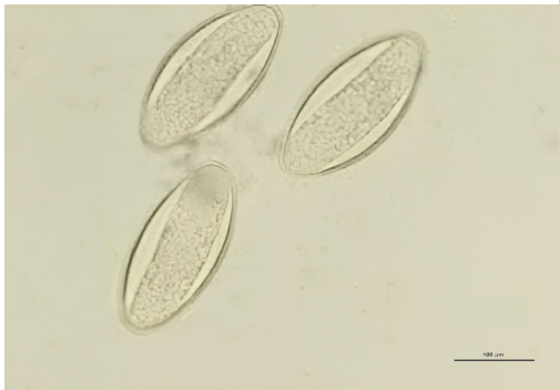
Figure 3. Eggs of Syphacia obvelata at the initial stage of incubation ( \times 450 )

tened poles and a thin, smooth shell exhibiting faint transverse striations (Fig. 3). The subtle texture gave the surface a finely lined appearance characteristic of this species. Laboratory cultivation of S. obvelata eggs under controlled conditions revealed active embryonic development, with up to 90% viability observed throughout the incubation period. A typical feature of the L1 larvae was the oval anterior end without a vesicle and an oesophagus with a distinct bulb and well-defined cuticular plates (Abdel-Gaber et al. , 2018) (Figs. 4-5).